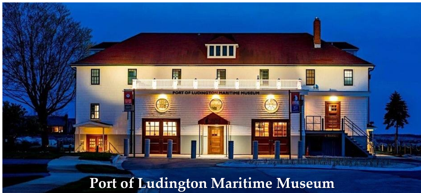
Port of Ludington Maritime Museum

Thursday, September 7 – West Shore Community College