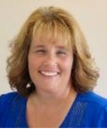
MASON COUNTY HISTORICAL SOCIETY