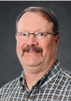
MACKINAC STATE HISTORIC PARKS